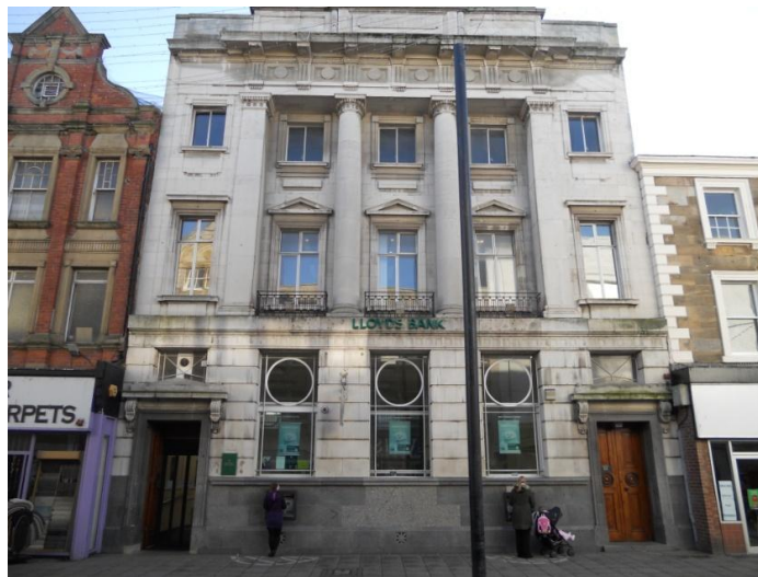
Existing Image: King Street

The works proposed in this statement/application do not interfere or alter any of the existing historic nature/materials of the building and are generally too more recent additions.